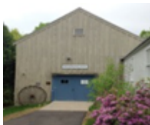
Freedom Historical Society

NON PROFIT U.S. POSTAL PAID FREEDOM, NH 03836 PERMIT NO. 5